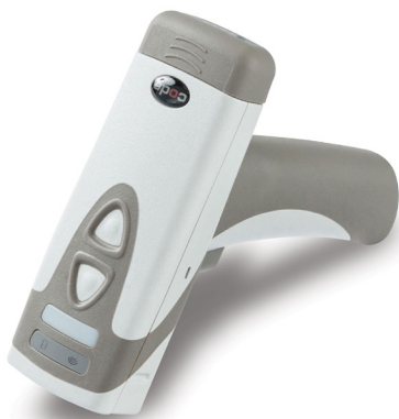
Code Reader 2600