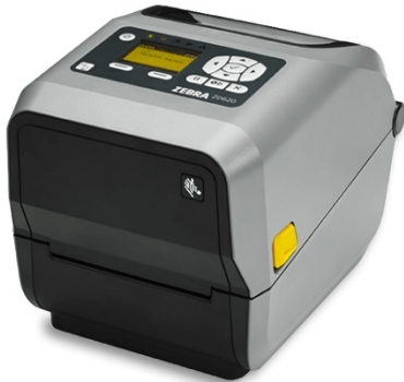
Zebra ZD620t Printer

Configuring formats and printing cryogenic barcode labels within Freezerworks lets you run your repository like a library. Freezerworks' efficiency, predictability, and auditability allow you to quickly locate, check-out, and pull samples. After testing, adjustments, or requisitions have been completed, samples are easily scanned and checked back in.